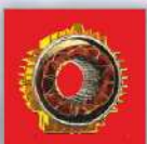
100% Copper Winding