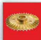
Optimized Design Forged Brass Impeller