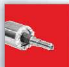
Dynamically Balanced Rotor & Shaft