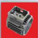
Aluminium Die Casting Motor Body