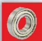
Double Shield Ball Bearings