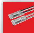
Inbuilt with Thermal Overload Protector